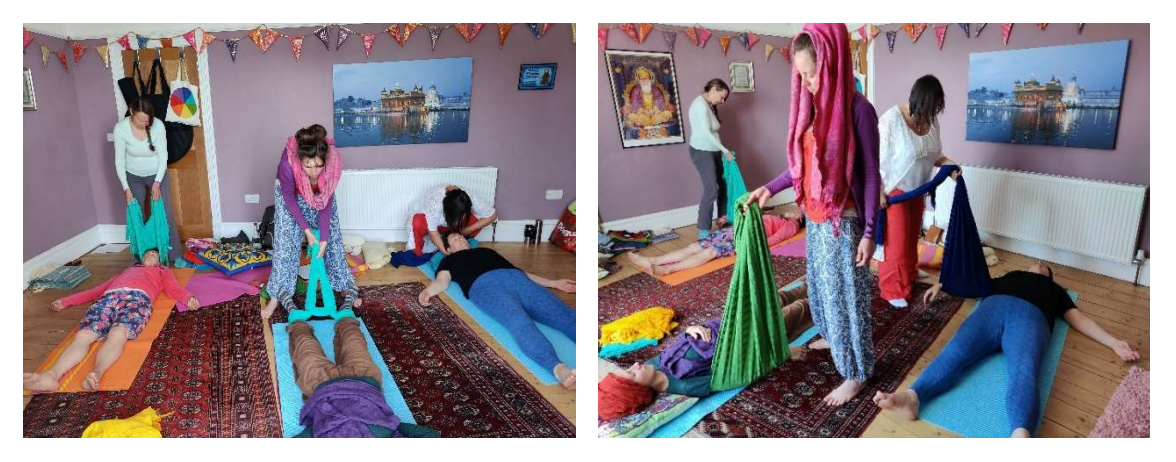
Participant numbers are consciously kept small - we have space for max. 8 participants.

I often get the question on whether babies or small children can come along for the training. As during this course we spend a lot of our time practising in pairs, babies would need to be put down and would get fed up and upset, and this would impair the learning for both the mother and the rest of the group. You are welcome to bring a breastfed baby if you can bring another adult with you who can take your baby out between feeding sessions.