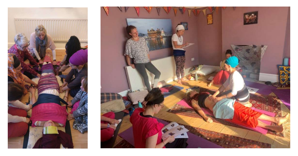
Do you feel called to use and integrate this very sacred and devotional work professionally (you might e.g. already be a birth worker, doula, midwife, massage therapist, pregnancy or postnatal yoga teacher, osteopath, psychologist, ...)? Or do you maybe just want to be able to offer your near and dear ones (family, friends, people in your community, ...) one of the most nourishing and soulful gifts you could gift them? You would be joining a tribe of over 700 women (and a few men) who are passionate about nurturing (mainly) women in this way - and we make sure to give you all the possible tools to really help you connect with that tribe and feel supported by them on your own journey as bone closer.

You can read a lot more about what Closing the Bones entails, and what ceremonies or treatments look like, on my webpage <u>http://www.shuniya-yoga.org/closing-bones-ceremony/</u> and on our international website of which you'll be invited to become a part: <u>www.closingthebonesmassage.com</u>.