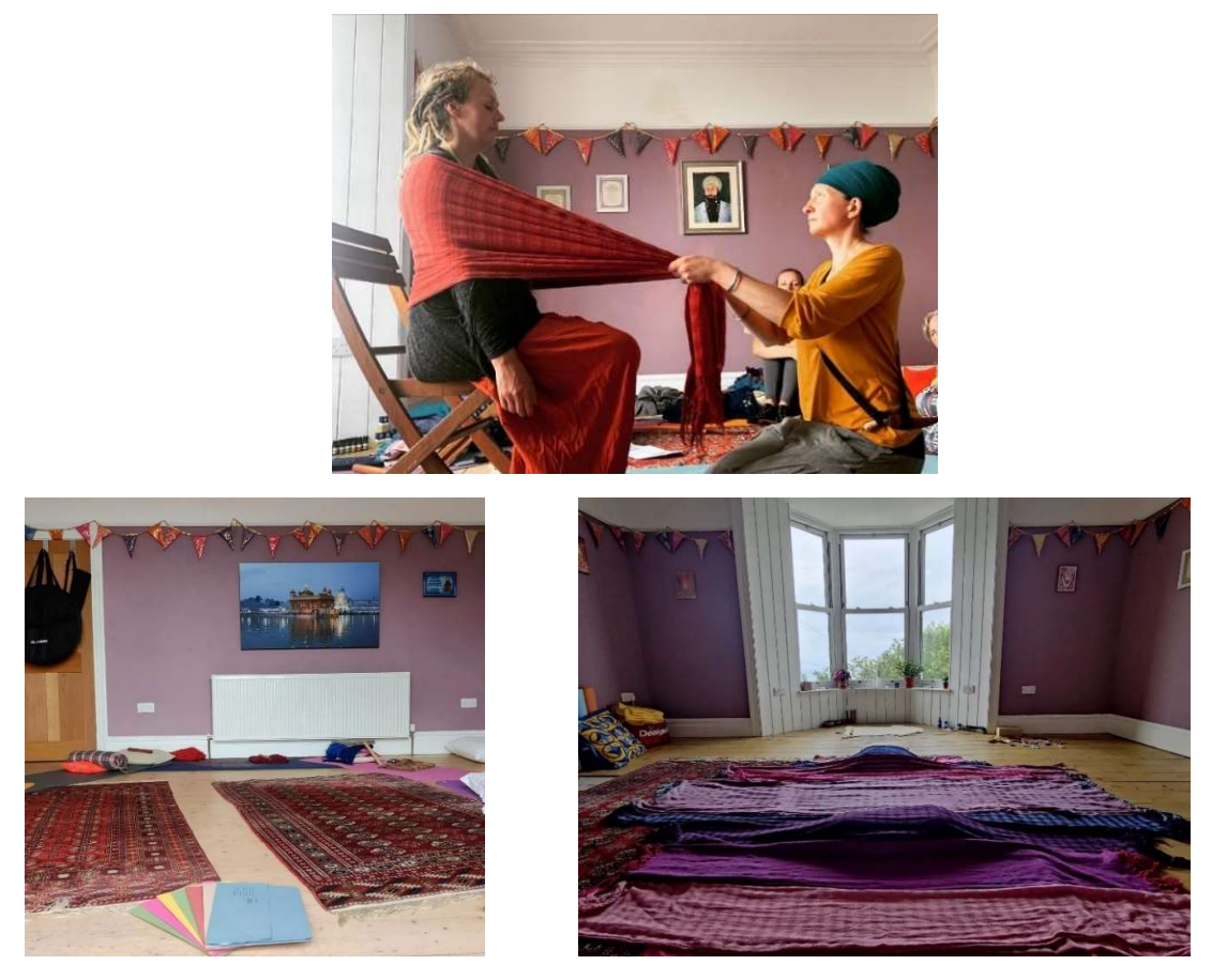
The training space in Portland with sea views

We are offering this training as an extended weekend-training with 30 hours of teaching, ceremony, and supervised practice time, all spent in deeply nurturing sisterhood and being cared for by myself and our host & cook Puran Arianna – with the option of on-site full-board accommodation!